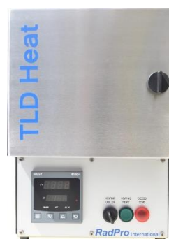
Programmable TLD Oven