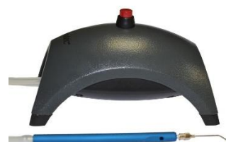
Vacuum Tweezers incl. Vacuum Pump