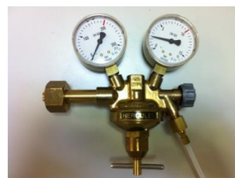
N2 gas pressure reducer, metric